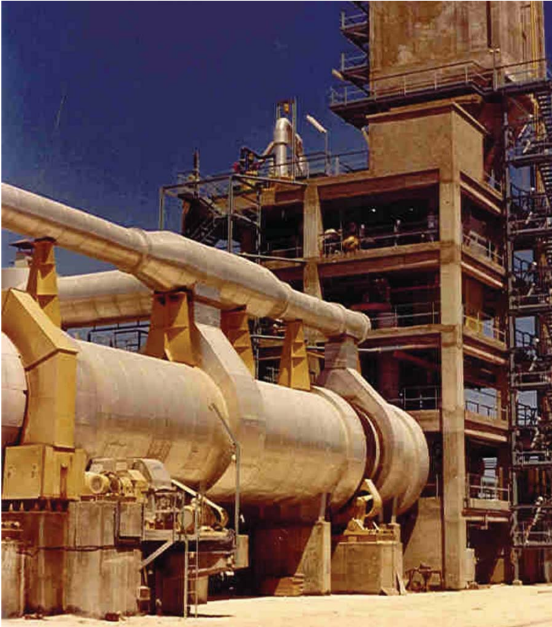
A Buss ChemTech plant for the production of aluminium fluoride