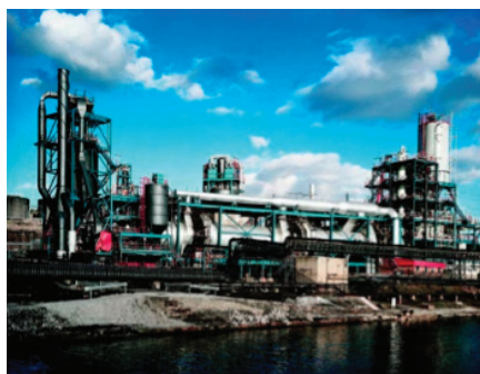
AHF Plant; Capacity 30,000 MTPY; Mexichem, UK

The drying is carried out in a flash dryer. The fluorspar is then transported by conveyors to the Fluorspar Silo.