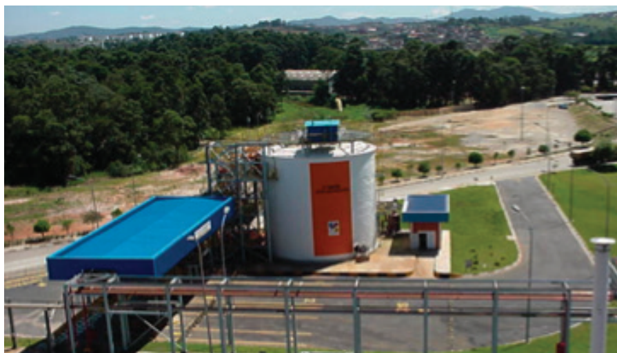
HF Storage, Sao Paulo Brazil

The vent gas flows to the Central Absorption.