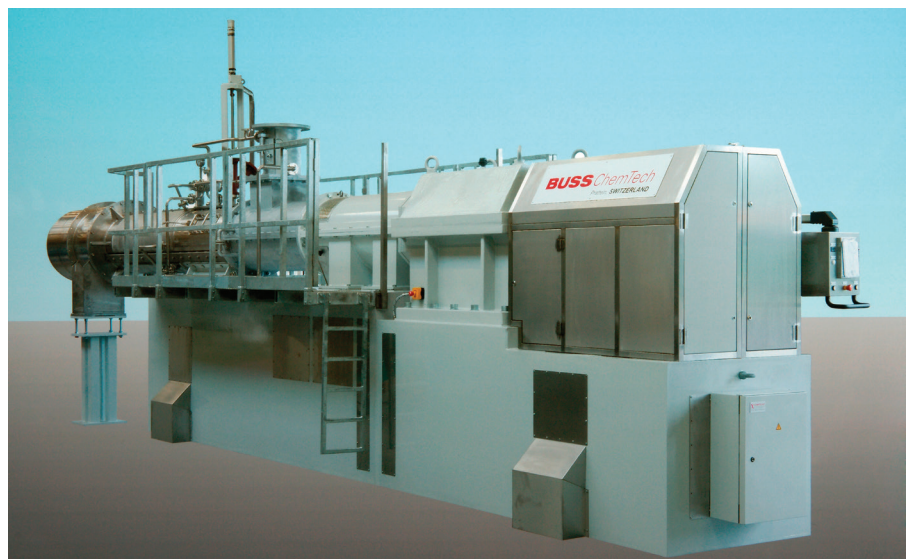
AHF Plant; Prereactor Capacity 53,000 MTPY; Gulf Fluor, Abu Dhabi